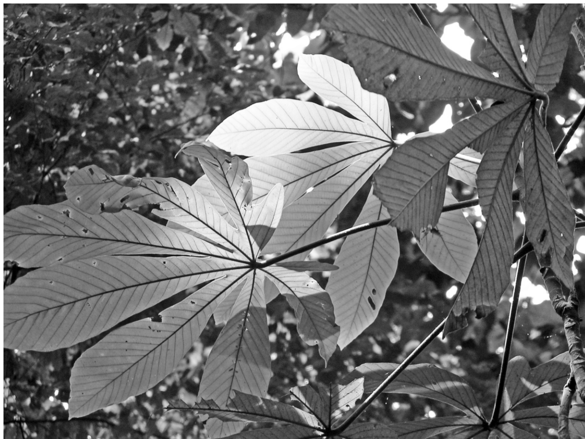
PLATE 1. Pourouma cecropiifolia leaf capturing sunlight in the La Chonta forest, Bolivia. A high specific leaf area is important to enhance the leaf display per unit of leaf biomass invested.

analysis was also carried out for the two sites (La Chonta and BCI) that had complete data for a sufficient number of species. Relative growth rate was negatively related to WD for La Chonta ( r^2 = 0.29 ) and negatively related to WD, SLA, and SV for BCI ( r^2 = 0.42 ; Appendix C).